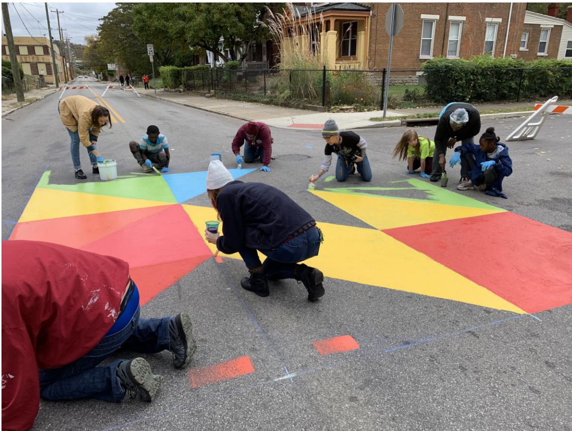
Intersection of Borden St and Dreman Ave in South Cumminsville

The City of Cincinnati has established a process by which neighbors can come together to install a pavement mural project on their street. This information packet explains the process and requirements.