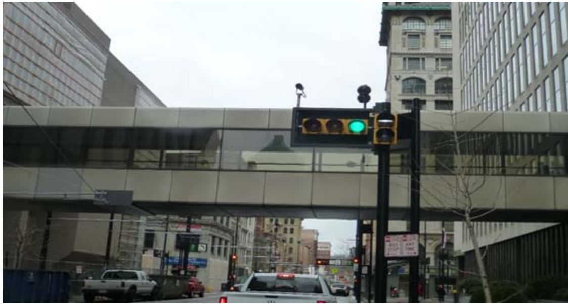
Walkway on Main Street between 5 th and 6 th Streets