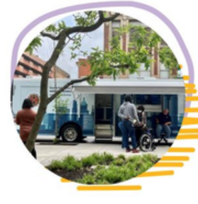
Specialized Service Shelters